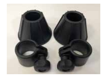
Couple of cones and hold rings