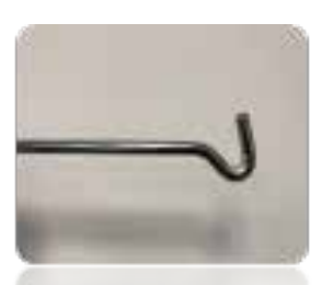
Additional Chrome Support