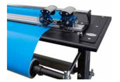
Cutting system (RH / Easy cut 165)