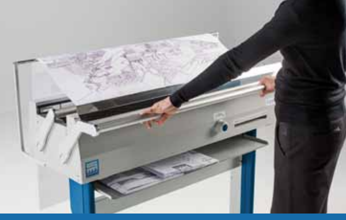
With FlexFold 1.1 fold your projects will be quick and easy! Just unlock the folding machine with the appropriate knob and open the pressure bands, put the paper and use the handle to fold perfectly at 21 cm.